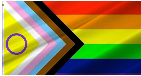
The yellow panel with a purple circle on the Progress Flag represents people who identify as intersex.